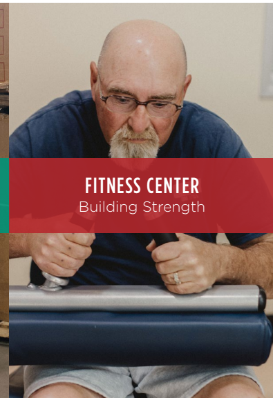
FITNESS CENTER Building Strength

By definition, impact cannot be achieved alone. In 2016, dedicated individuals and the collective community produced notable accomplishments.