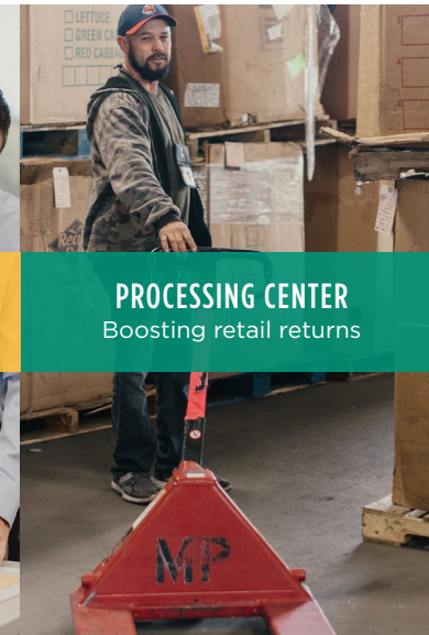
PROCESSING CENTER Boosting retail returns